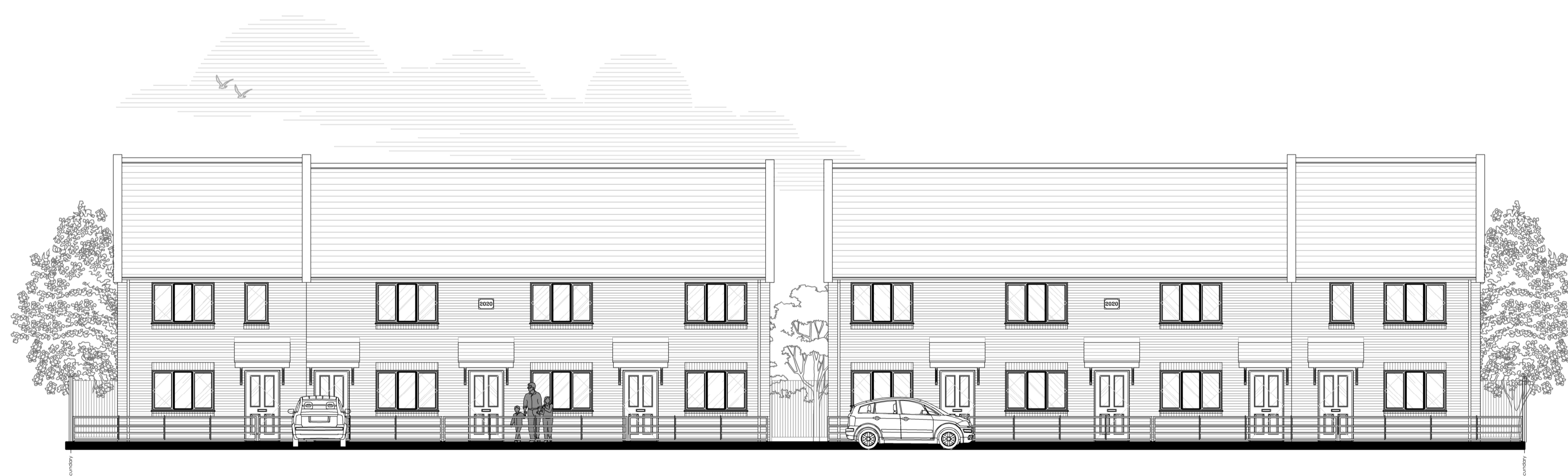
Street Elevation - View 2