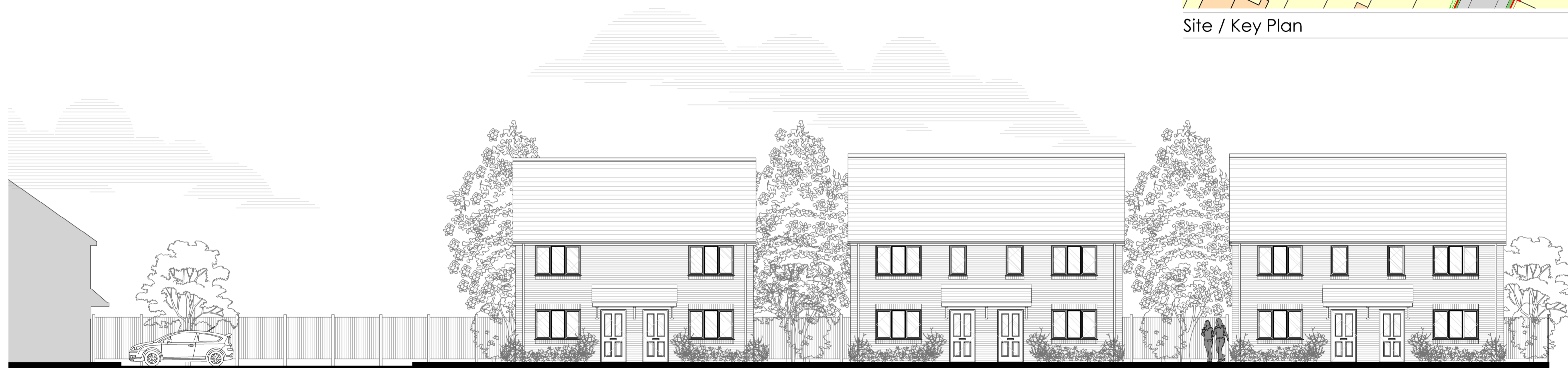
Street Elevation - View 1